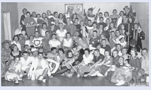
we are here for. It's Junior Prom, Knights of the Round Table, 1956 time to refresh your

The photo on the left is from junior prom, Knights of the Round Table, in 1956. Clearly, they brought their A-game