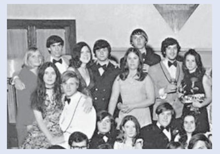
Spring formal, 1971

with the costume selection. On the right is the fall '70 and spring '71 pledge class at their formal, looking snazzy in tuxes and floor-length, patterned gowns. Don't these photos take you back to the glory days? So