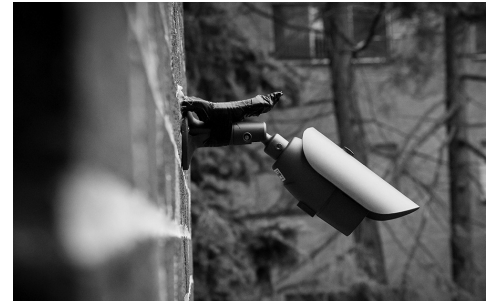
Security cameras have been installed outside the house ...

Within the last year, we have undertaken some important projects at the house. In total, our alumni brotherhood has spent over $70,000 on maintenance, upgrades and repairs to the house. This summer, many rooms were painted and all move-out repairs were completed. Most importantly, new security cameras were installed