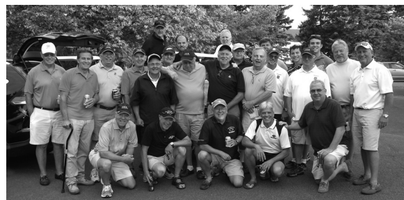
An impressive gathering of Pi Kapp brothers attended our '60s and '70s reunion this summer. For more photos, go to the Photos section of our website, www.alphamupikap.org .