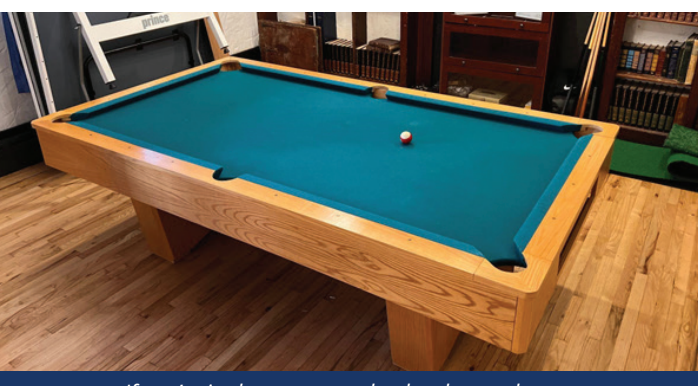
If you're in the area, stop by the chapter house and check out our new pool table!

Alumni should feel free to e-mail any officer or stop by the house if they're in town if they have any questions or want to take a walk through the house!